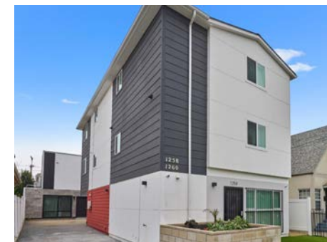
1258 W 37TH DR Los Angeles, CA 90007