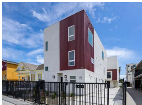
1286 W 35TH PL LOS ANGELES, CA 90007