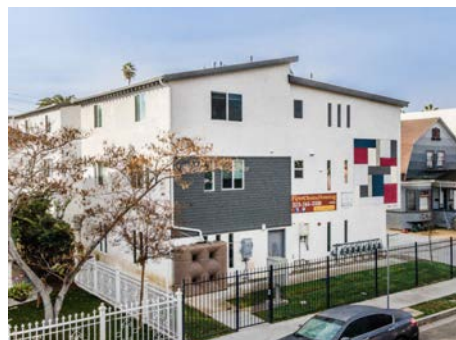
1136 W 36TH ST Los Angeles, CA 90007