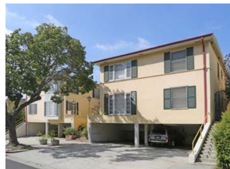
545-559 MIDVALE AVE LOS ANGELES, CA 90024