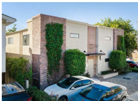
1901 OVERLAND AVE LOS ANGELES, CA 90025