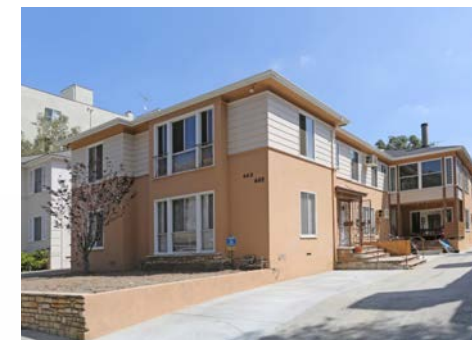
442-446 KELTON AVE LOS ANGELES, CA 90024