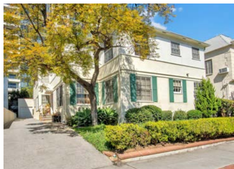
10721-10723 1/2 ASHTON AVE LOS ANGELES, CA 90024