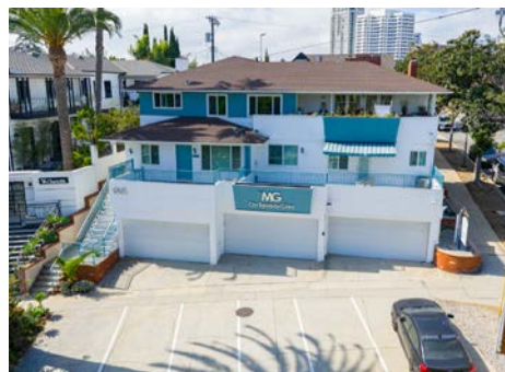
1301 S BEVERLY GLEN BLVD LOS ANGELES, CA 90024