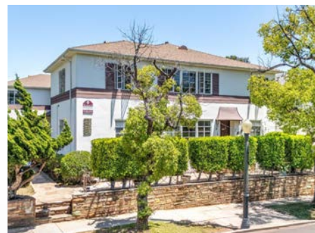
630-634 MIDVALE AVE LOS ANGELES, CA 90024