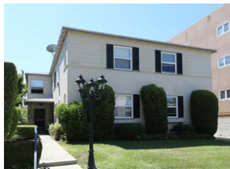
10620 HOLMAN AVE LOS ANGELES, CA 90024