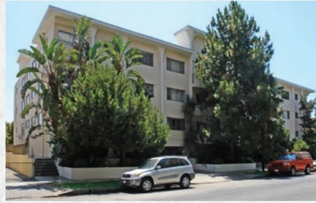
142 S WETHERLY DR Los Angeles, CA 90048