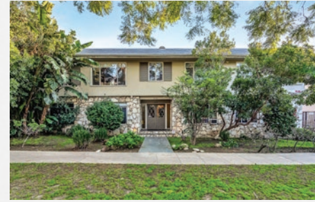
8218 DE LONGPRE AVE West Hollywood, CA 90046