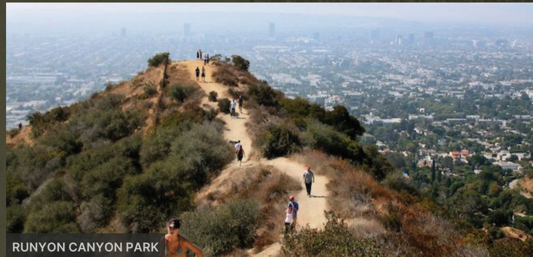
RUNYON CANYON PARK