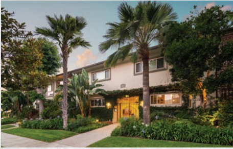
1633 N Laurel Avenue Los Angeles, CA 90046