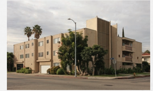
1301 N MANSFIELD AVE Los Angeles, CA 90028