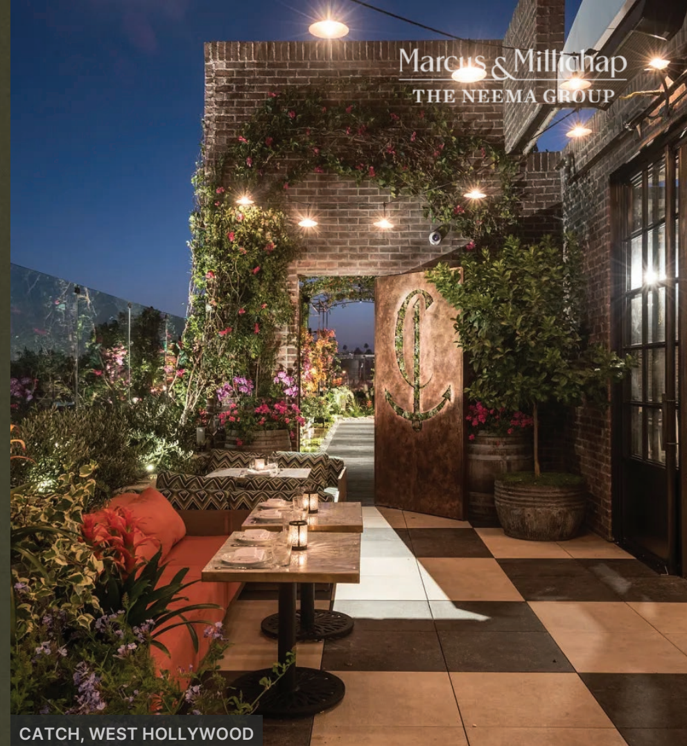
CATCH, WEST HOLLYWOOD

West Hollywood's culinary landscape is the envy of Los Angeles. Trendy hotspots, historic restaurants and beloved neighborhood diners line the streets, featuring diverse and innovative cuisine from award-winning chefs. Well-known restaurants include AGO, Eveleigh, Catch, Katana, ROKU, BOA Steakhouse, Chateau Marmont, Craig's, Ceconi's, and many more. In addition to the fine dining venues, West Hollywood offers many relaxing cafés, boutique eateries, and other local favorites such as Dan Tana's, Gracias Madre, Hugo's, The Den, Marco's Trattoria, Los Tacos, and Le Petit Bistro.