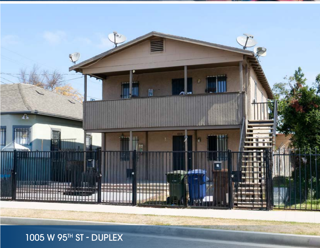
1005 W 95 TH ST - DUPLEX