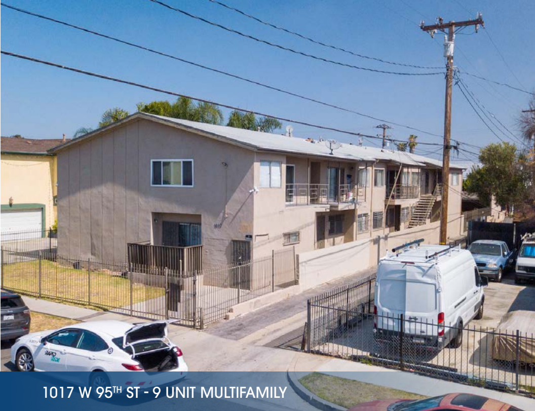
1017 W 95 TH ST - 9 UNIT MULTIFAMILY