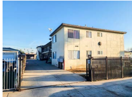
1249 W 107 TH ST LOS ANGELES, CA 90044