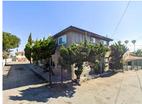
1115 W 111 TH ST LOS ANGELES, CA 90044