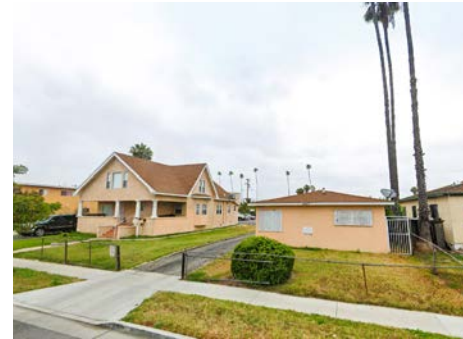
1027 W 91 ST ST LOS ANGELES, CA 90044