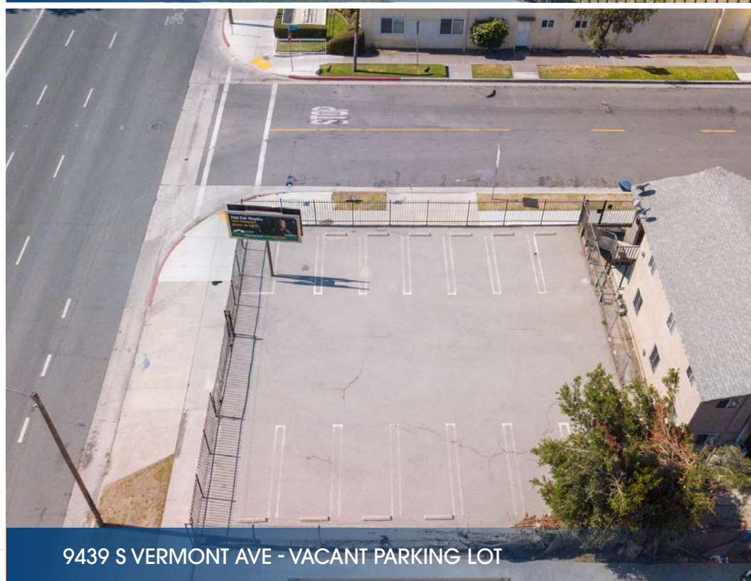
9439 S VERMONT AVE - VACANT PARKING LOT