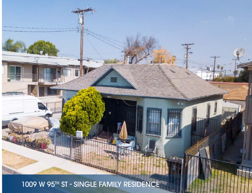
1009 W 95 TH ST - SINGLE FAMILY RESIDENCE