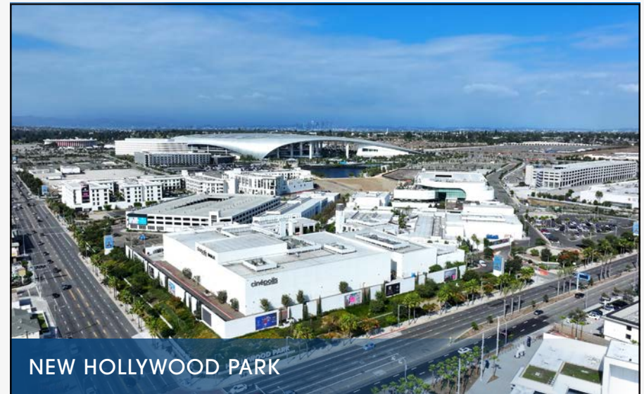
NEW HOLLYWOOD PARK

Since opening, SoFi Stadium has become a major destination for sports, concerts, and international events. It hosted Super Bowl LVI, WrestleMania 39, and numerous high-profile concerts and is scheduled to host matches during the 2026 FIFA World Cup and events for the 2028 Summer Olympics. Beyond its role as a sports venue, the stadium symbolizes Los Angeles' investment in entertainment, tourism, and modern architecture, while also contributing to the ongoing development of the surrounding Inglewood area.