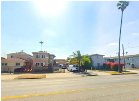
442-446 W 93 RD ST LOS ANGELES, CA 90003

1005-1009 & 1017 W 95 TH ST, LOS ANGELES, CA 90044