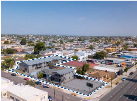
1005-1009 & 1017 W 95 TH ST LOS ANGELES, CA 90044

1005-1009 & 1017 W 95 TH ST, LOS ANGELES, CA 90044