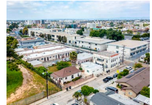
8715 REGINA CT LOS ANGELES, CA 90044