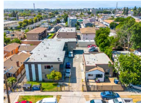
844 W 92 ND ST LOS ANGELES, CA 90044