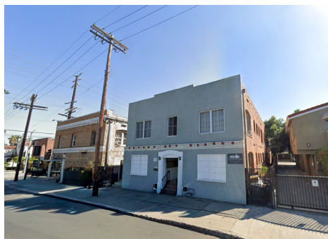
4452 FINLEY AVE LOS ANGELES, CA 90027

1845 N NEW HAMPSHIRE AVE, LOS ANGELES, CA 90027