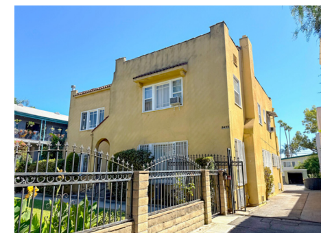
5418 FRANKLIN AVE LOS ANGELES, CA 90027