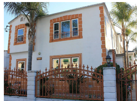
1167 N KINGSLEY DR LOS ANGELES, CA 90029