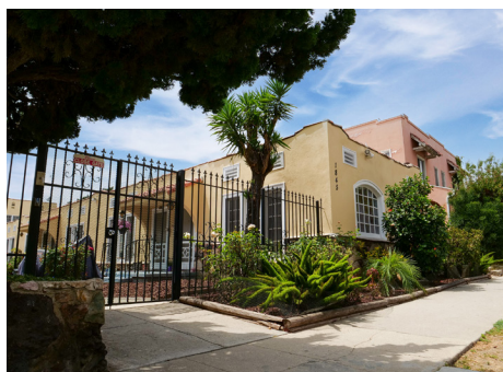
1845 N NEW HAMPSHIRE AVE LOS ANGELES, CA 90027

1845 N NEW HAMPSHIRE AVE, LOS ANGELES, CA 90027