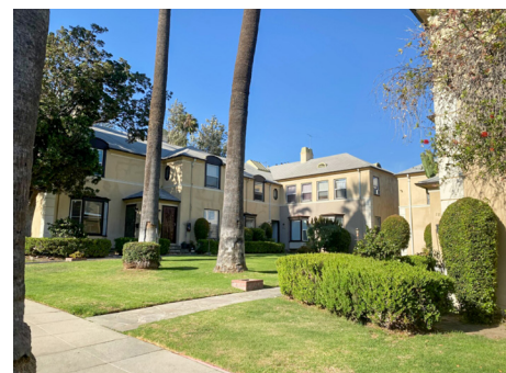
1852-1862 N EDMONT ST LOS ANGELES, CA 90027