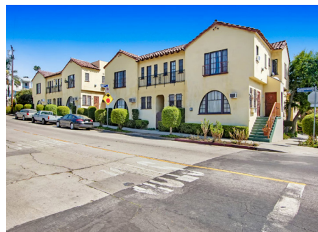
2050-2062 COMMONWEALTH AVE LOS ANGELES, CA 90027