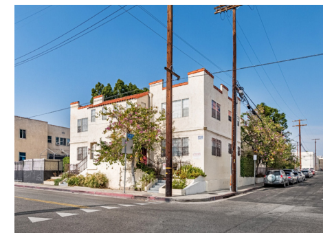
4563 W FOUNTAIN AVE LOS ANGELES, CA 90029