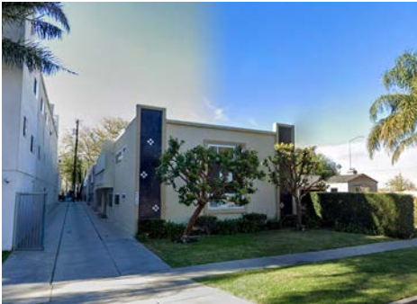
4719 VISTA DEL MONTE AVE SHERMAN OAKS, CA 91403