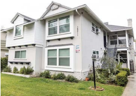
16011 VICTORY BLVD VAN NUYS, CA 91406