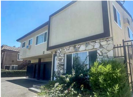
5453 KESTER AVE SHERMAN OAKS, CA 91411